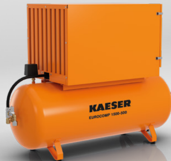
Image: EPC 1500-500