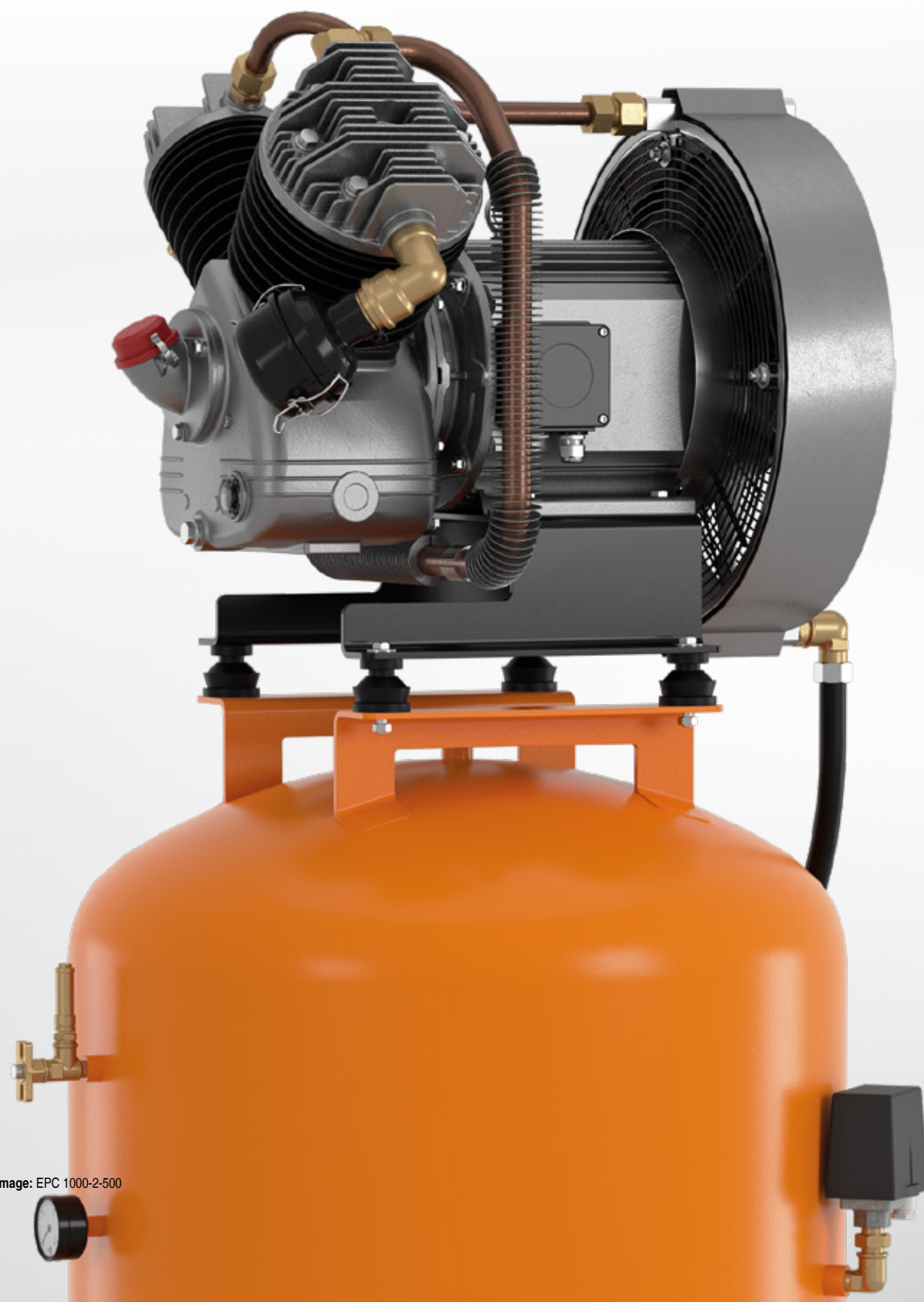
Image: EPC 1000-2-500