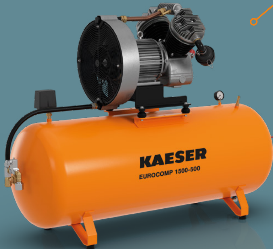
Image: EPC 1500-500