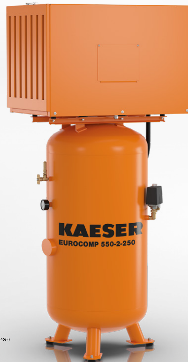
Image: EPC 550-2-350

High-quality components for a long service life