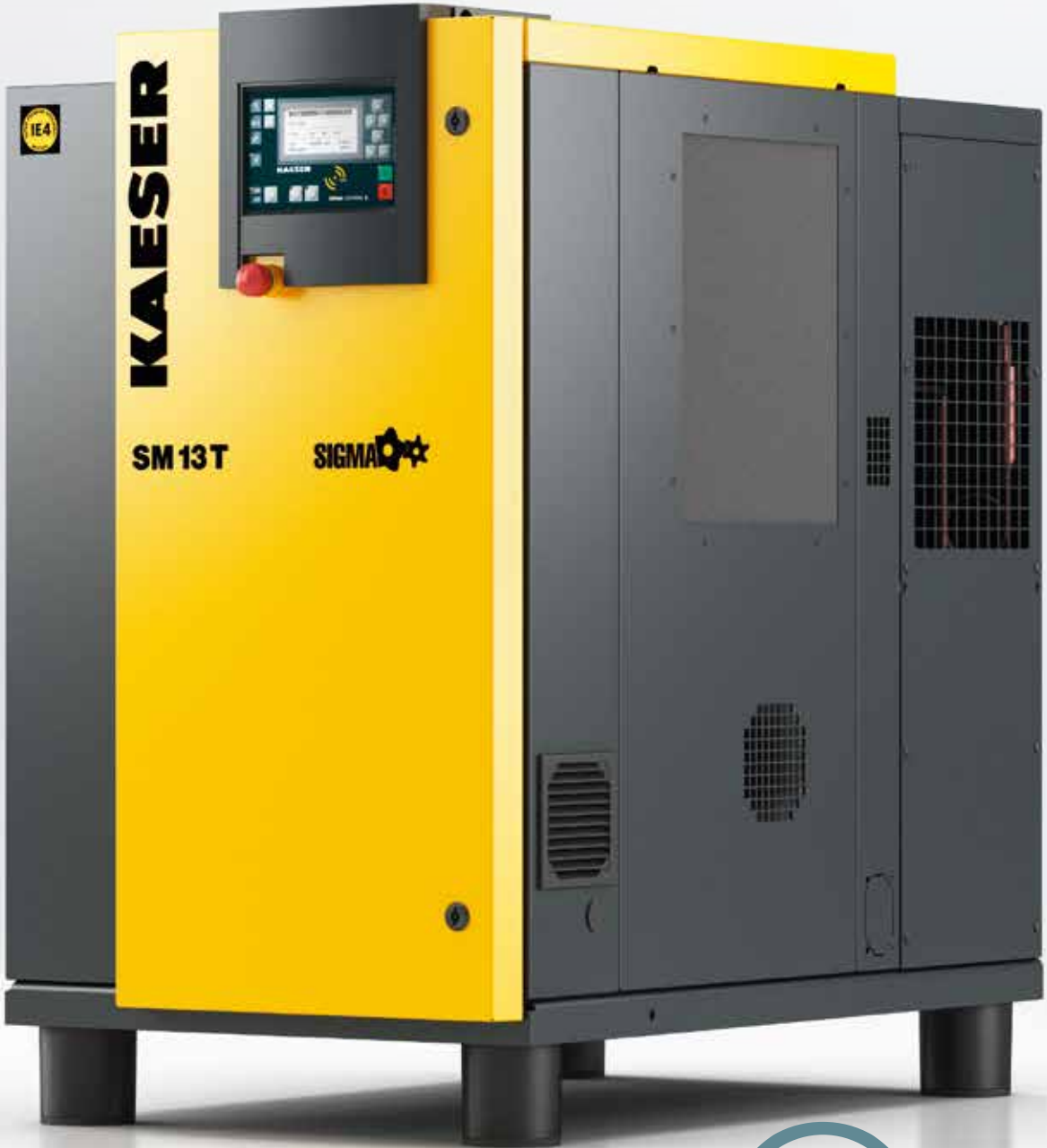
Image: SM 13 T

All maintenance work can be carried out from one side of the unit. The left housing cover is easily removed to allow excellent component accessibility.