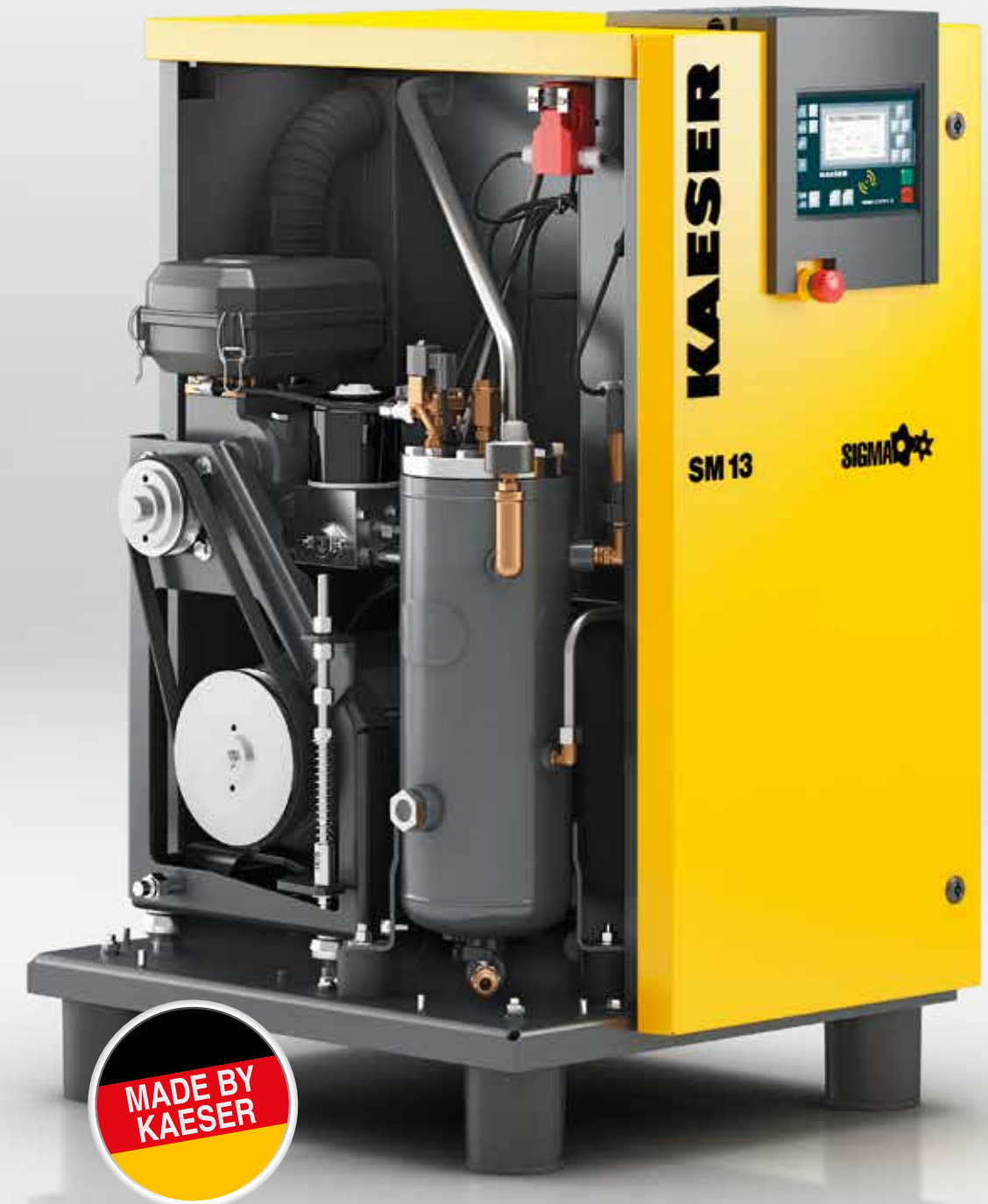
Image: SM 13